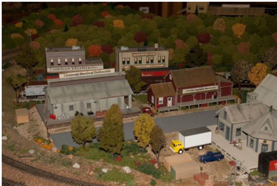
Details from scratch